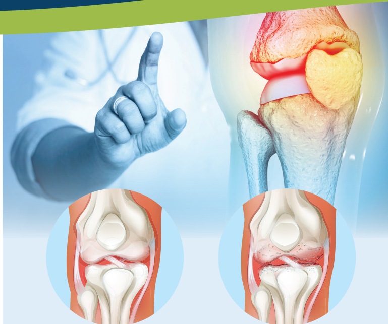
Normal Knee Joint

Today there is a new treatment option: Genicular artery embolization (GAE).